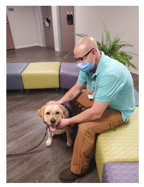
Omaha with CFR staff member

Granted, soul-soothing cannot be found among the learning objectives in a formal education program at a college or university, but it was imperative for Ortner's colleague to master a rather exhaustive training regimen that, akin to elite military forces, not all participants can physically or mentally complete.